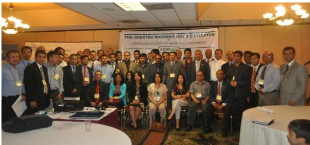
Some attendees at the Joint ASNEng/CAN-USA Annual Conference at Leesburg, VA; May 26-27, 2012

The theme of this conference was “ Bringing Engineering, Scientific and Technological Communities Together for a Better World ”. The conference provided an excellent opportunity for the participating engineers, scientists, and related professionals to share their knowledge and experiences on relevant topics, including but not limited to, Earthquake Preparedness and Disaster Relief in Nepal, Energy and Environmental Issues and Concepts, and Recent Advances in Engineering and Science. The conference included four technical sessions with 15 presentations among which three were presented from Nepal via the Skype connection.