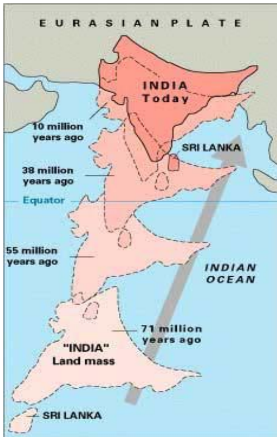
Figure 1. The Indian Plate moves northward and collides with the Eurasian plate over millions of years forming the Himalayan Mountain Ranges.

advance. Generally, the main quake is followed by aftershocks of similar or lesser magnitude. These aftershocks are known to bring plenty of panic and misery to the victims already suffering from the main quake.