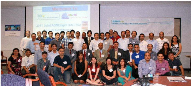
Some attendees at the ASNEng/CAN-USA Joint Conference at Houston, TX – July 9-10, 2011