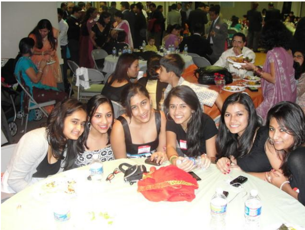
A scene from the Greater Washington D.C. Nepali Engineers' Night.