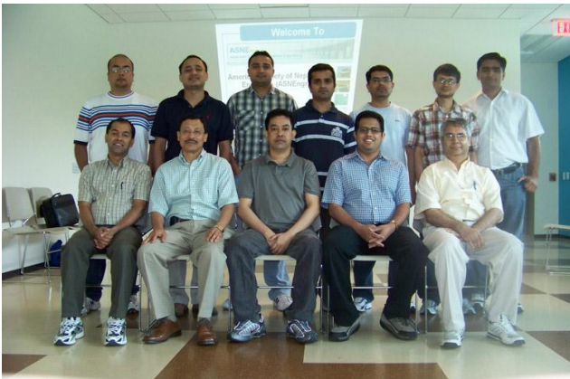
Houston Nepalese Engineers in the meeting on April 30, 2011