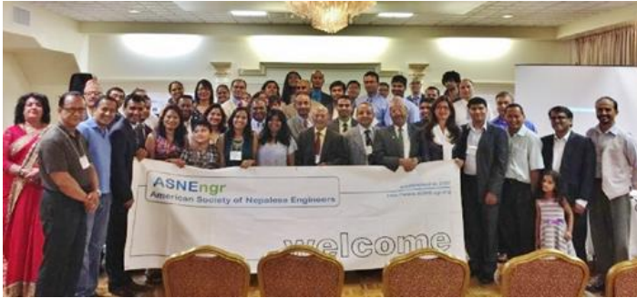
A Group Photo of Some of the Attendees at the 8 th Annual ASNEng/CAN-USA Joint Conference, North Brunswick, NJ: August 29-30, 2015